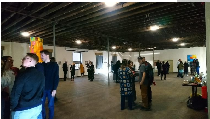
Some of the art and poetry pieces and the exhibition room