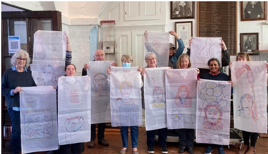
Right: The banners (central column) as part of a larger display for a project with the Tate Modern